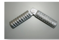
Aluminum Joiner ADAADJ 24pcs / Box