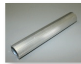
Joiner Kit ADAJKT 24pcs / Box