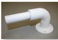
90-Degree Return Bracket White: ADA90RBW Black: ADA90RBB 12pcs / Box