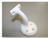
Standoff Bracket White: ADASOBW Black: ADASOBB 12pcs / Box