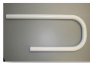
Handicap Loop White: ADAHDLW Black: ADAHDLB 6pcs / Box