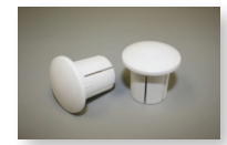
End Cap White: ADAECAPW Black: ADAECAPB 100pcs / Box

Install TimberTech railing on any surface, including concrete!